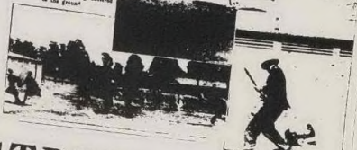
Top: Mine workers before the police charge. Bottom (right): A small-scale engagement between miners and police. Typical of hundreds which took place on the Reef during the strike. Bottom (left): An Afrikaans miner being battered in the ground.