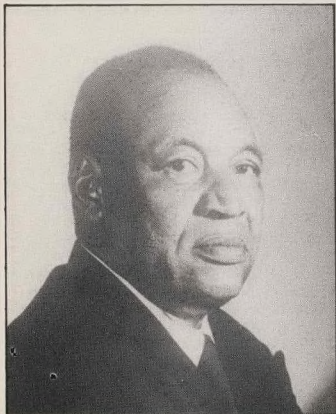
Left: JB Marks President of the African Mine Workers Union at the time of the strike.