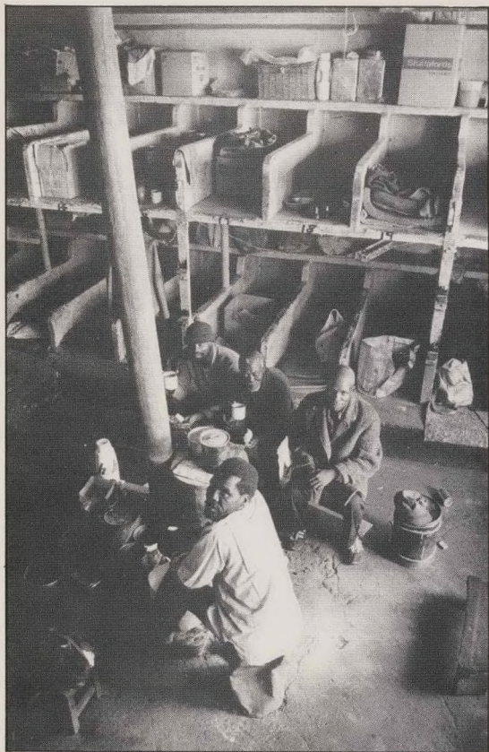
Living conditions for miners in the 1980's. (Consolidated Main Reef Mine)