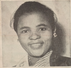
Miss East London had the best luck to be held on as the way to the Miss South Africa finals. She'd have done well!