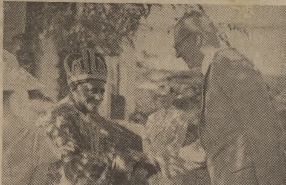
The Secretary of State for the Colonies, the Rt. Hon. Oliver Stanley, is seen in this picture shaking hands with a Nigerian Chief at a reception held in his honour at Government House in Lagos, West Africa.

In the past nine days on all fronts, the Germans have lost nearly 1,000 tanks, including those damaged and captured. In the same period they have lost about 36,000 men killed.