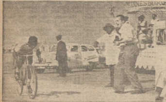
A GREAT FINISH — The winner, a member of the Hercules and Phillips Cycle Club, passes the finishing post in the outstanding time of 2 hours 43 minutes.

There were over 3,000 people to see the finish of the exciting Festival Marathon at the winning post in Moroka, Johannesburg — and thousands more watched all along the road from the start in Potchefstroom.