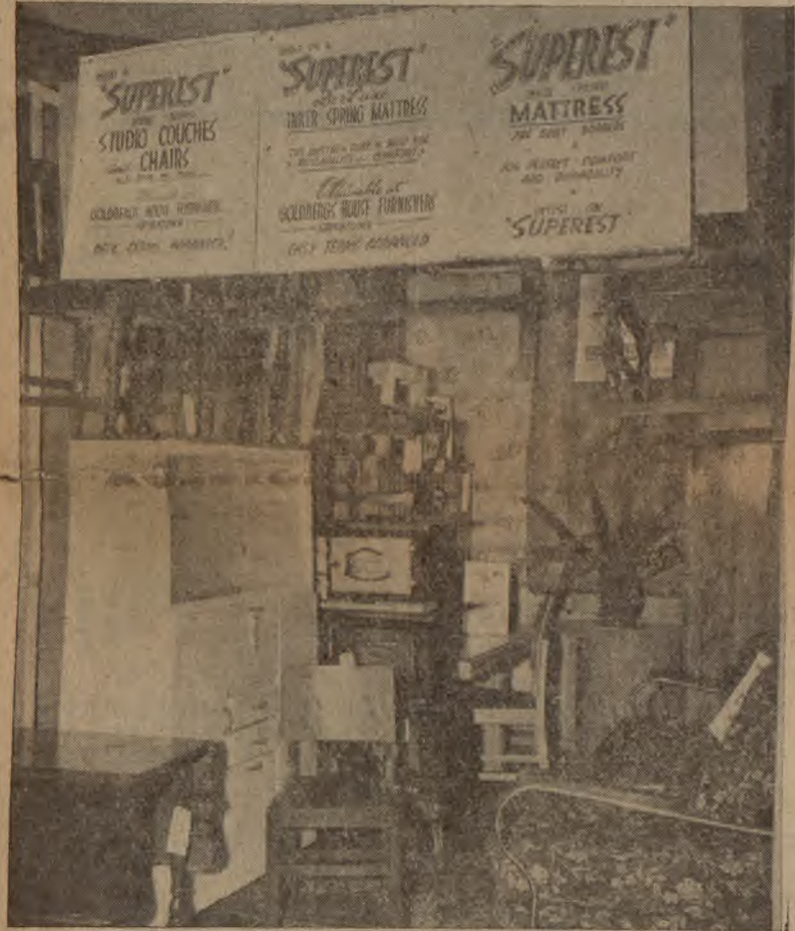
Goldberg's House Furnishers stall at Orlando. Take it your business to visit us at 7, Good Street and 310 Main Road, Martindale. Also at Kliptown Furnishers, 99 Union Road, Kliptown.

The Industrial And Commercial Exhibition Opens At The B.M.S.C. On Wednesday, June 28