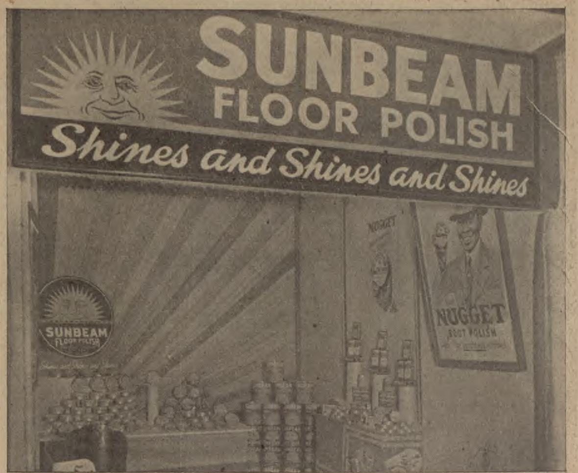
The Sunbeam stall brings sunshine to Orlando. Insist on Sunbeam and Nugget for your floors and shoes.