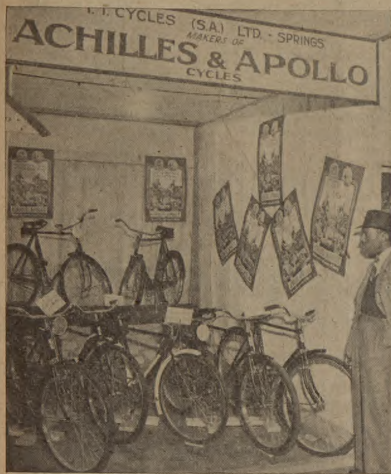
BY HERCULES AND PHILLIPS. Four famous names with a guarantee of quality.