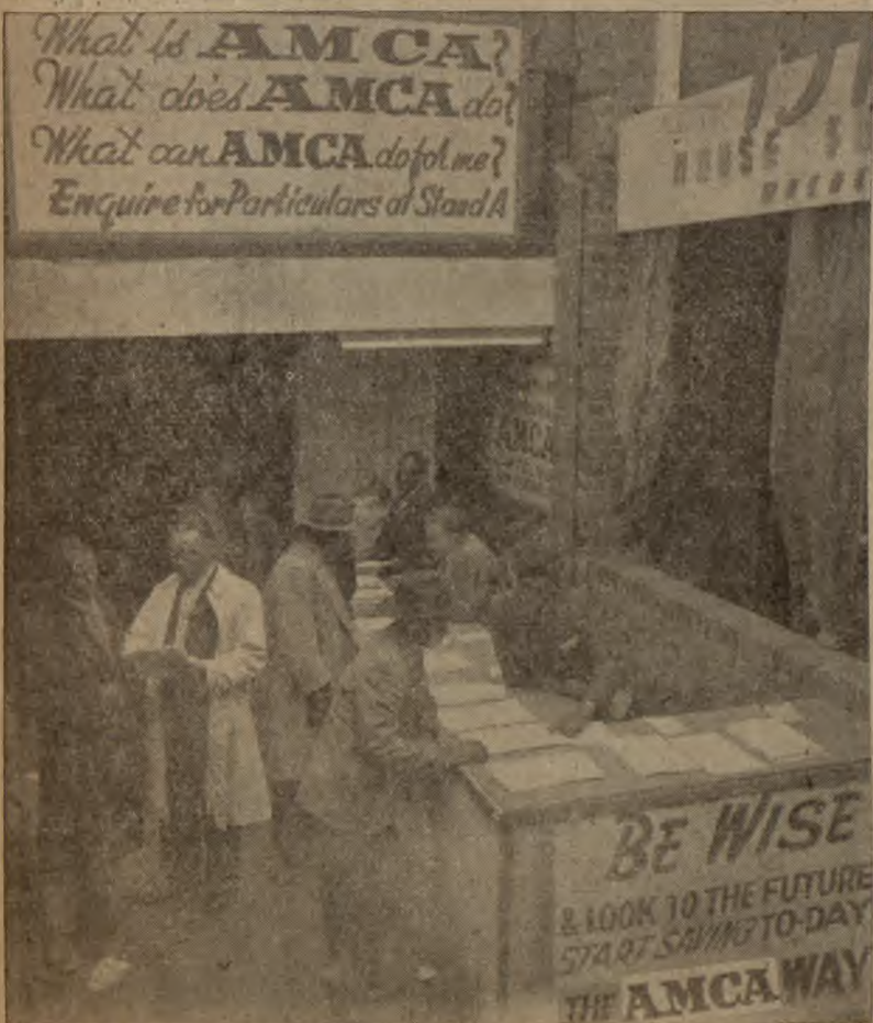
Follow the people and provide for your future by enrolling with AMCA. to-day at 8, De Villiers Street. Branches throughout the Union.

The Industrial And Commercial Exhibition Opens At The B.M.S.C. On Wednesday, June 28