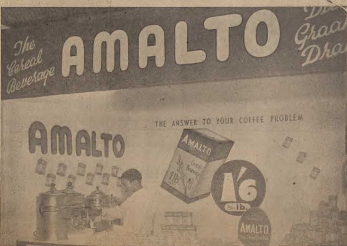
The Amalto stand at the Exhibition—one of the most popular there. Thousands sampled Amalto, the cereal beverage, and were thrilled by its flavour and also by its economy. Amalto is only 1/6d. per lb. and is obtainable everywhere. It is manufactured by the famous Dee Vee Company. You can get a large free sample of Amalto by sending 1d. stamp and your name and address (In block letters) P.O. Box 3871, Johannesburg. You make Amalto the same way as you make coffee.