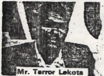
Mr. Terror Lekota