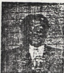
Mr. Archie Gumede