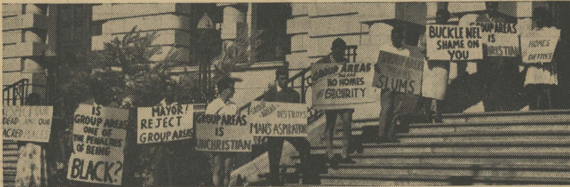
People of all races took part in a demonstration against Group Areas in Durban recently.