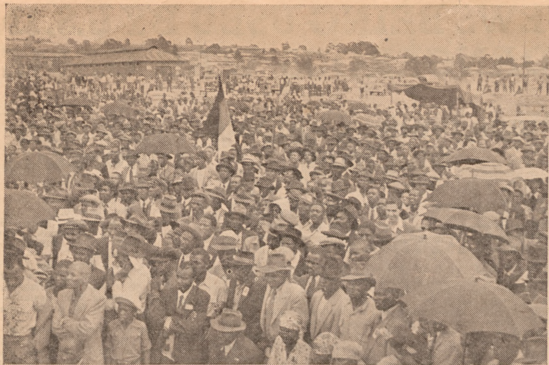
A section of the crowd which welcomed Chief Luthuli at the rally organised in Johannesburg on the occasion of Colonial Youth Day.