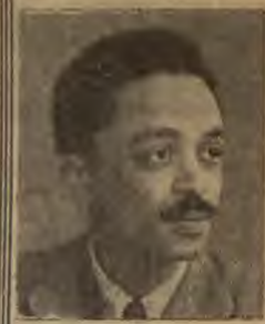
Mr. Peter Abrahams