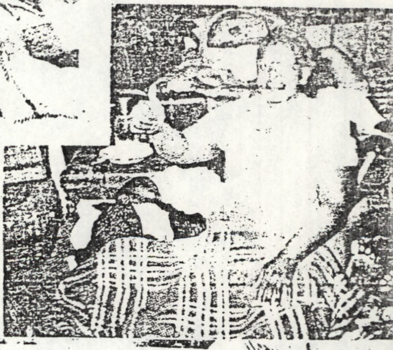
Women travelled long distances to arrive in Pretoria the night before August 9th. Thousands lay all night on hard floors or held "wakes".