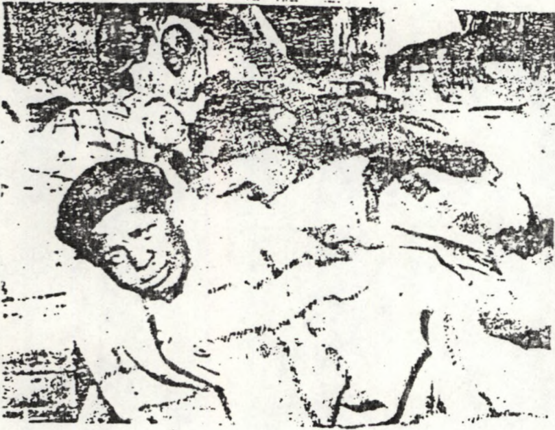
Women travelled long distances to arrive in Pretoria the night before August 9th. Thousands lay all night on hard floors or held "wetats".

"I was there!" Twenty thousand women filled the Union Building Amphitheatre on August 9th, 1956. Here the women are still pouring in.