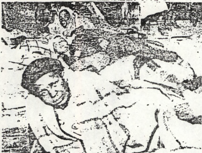
Many mothers brought their children. They were tired — but their spirit was unquenched.

"I was there!" Twenty thousand women filled the Union Building Amphitheatre on August 9th, 1956. Here the women are still pouring in.