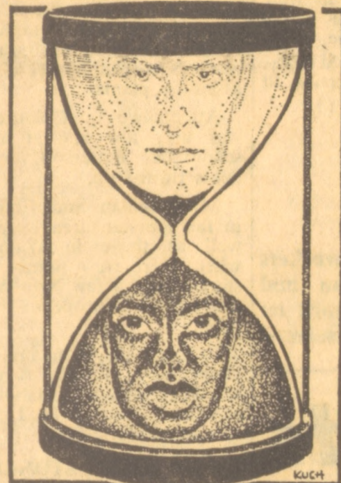
The Sands of Africa —Winnipeg Free Press

The most recent exposures of the CIA have come from the French