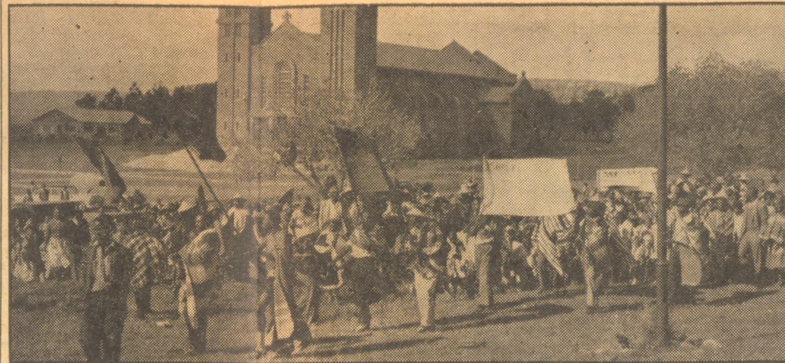
B.C.P. Ceremony In Maseru

ABOVE: Members of the Basuto-land Congress Youth League took part in a demonstration at the opening of the new BCP offices in Maseru recently. RIGHT: A traditional Basuto blanket was presented to BCP leader Ntsu Mokhehle at the opening ceremony.