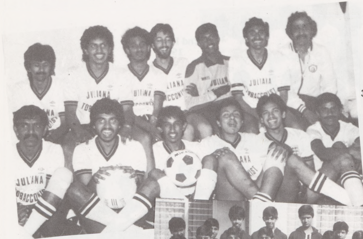
3rd Division 1987