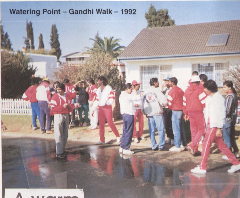
Watering Point – Gandhi Walk – 1992