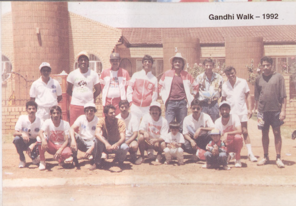
Gandhi Walk – 1992

There shall be houses, security and comfort for all. -- LESCO and LYL, Lenasia.