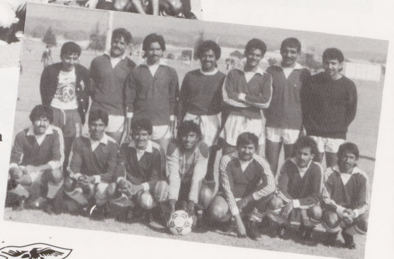
2nd Division 1989