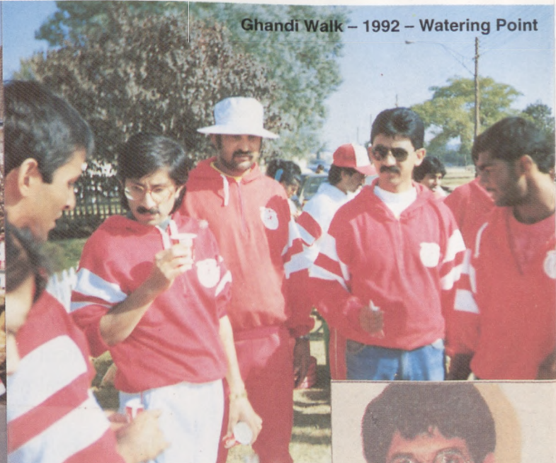
Ghandi Walk – 1992 – Watering Point