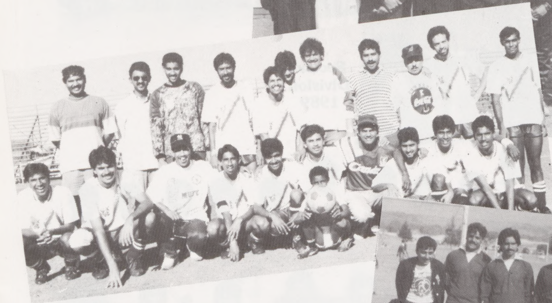
Coke Knockout Winner 1993