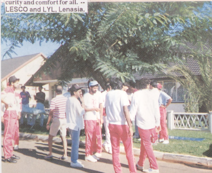
Tiba Fun Run – 1993 – Watering Point