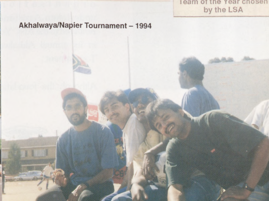
Akhalwaya/Napier Tournament – 1994