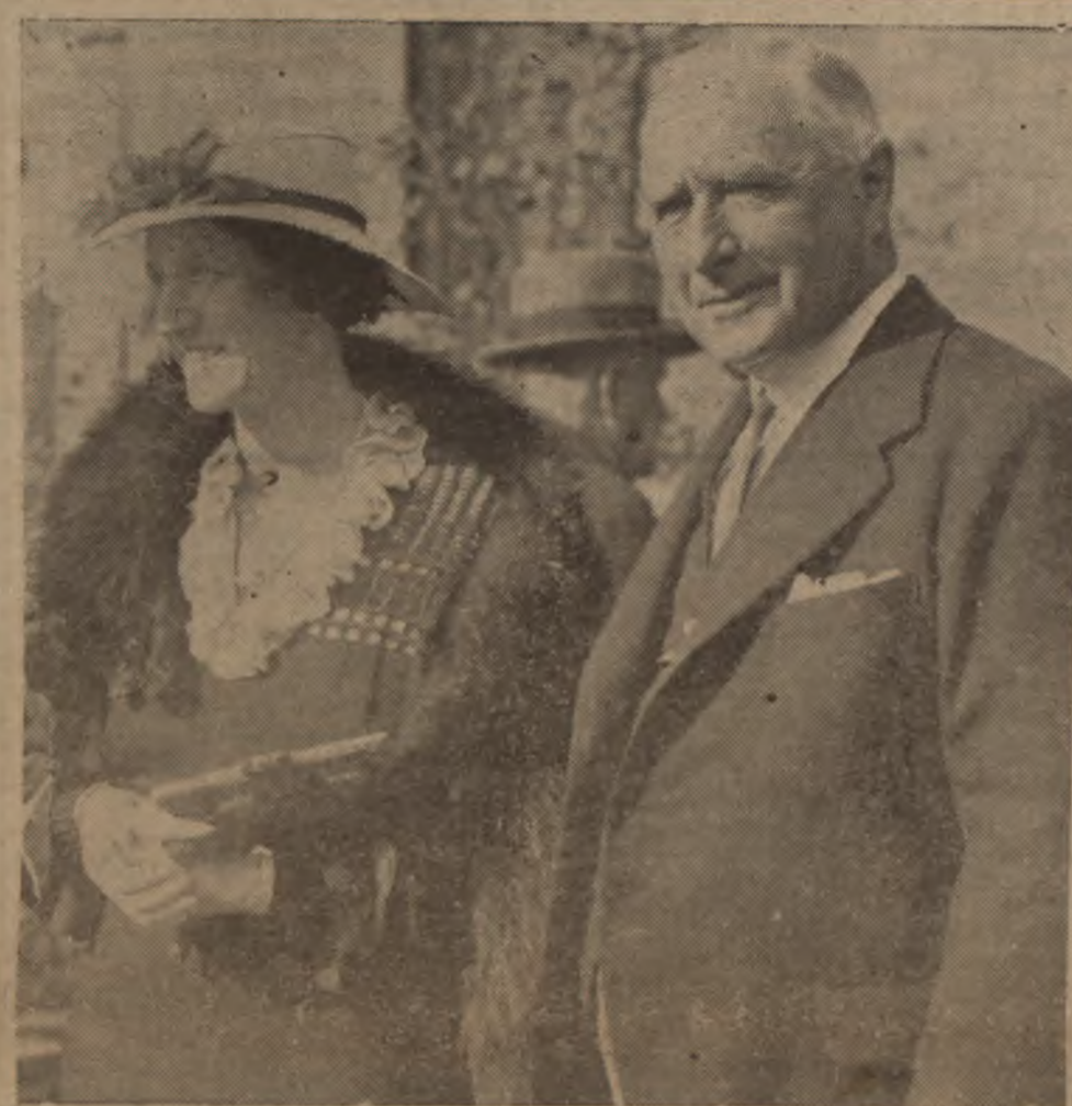
Sir Patrick Duncan, K.C., K.C.M.G., Governor General Designate of the Union of South Africa and Lady Duncan.