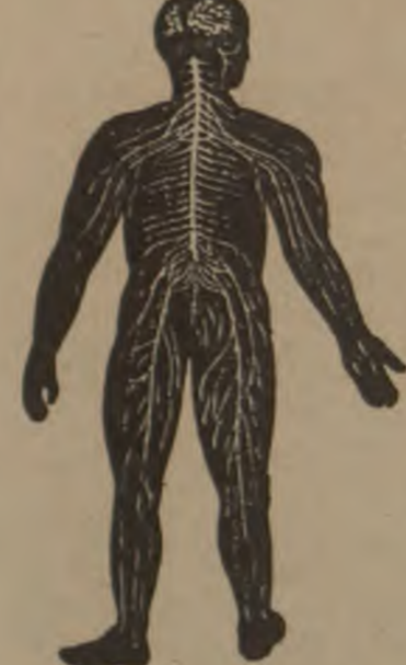
The Nerves control the whole body. They run from the Brain to all corners of the body. You cannot be strong without good Nerves.

No man or woman can be strong and healthy if the Nerves are out of order. Any person can tell when the Nerves are weak by the following symptoms:—Shakiness, tiredness, headaches, trembling over the stomach, buzzing in the ears, backache, pain over the heart, heart attacks, bad dreams, troubled sleep, unrefreshed feeling in the morning, fear of responsibility and work, no desire for pleasure and a desire for complete rest or death.