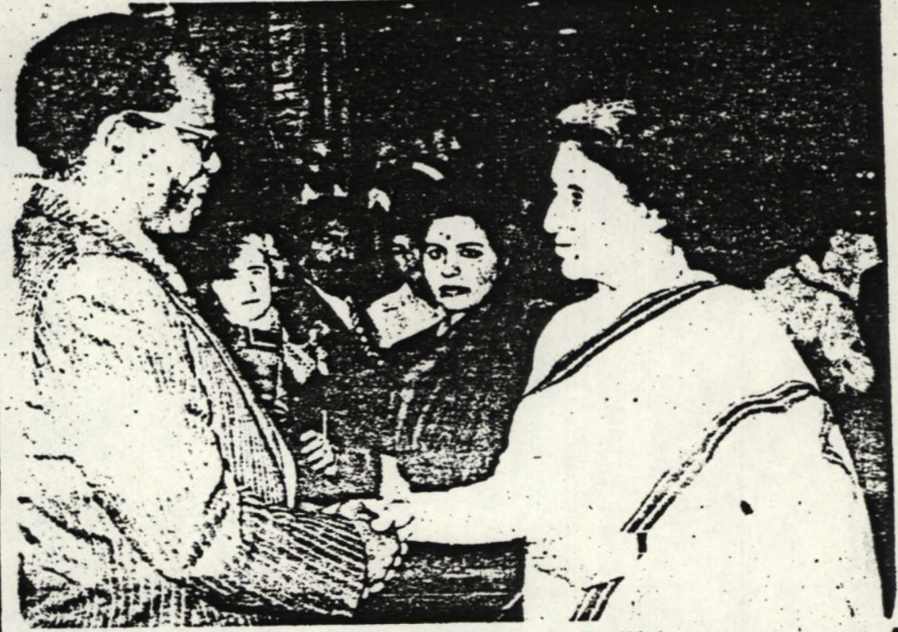
Cde President Oliver Tambo with Mrs Indira Gandhi, the new chairperson of the Non Aligned Movement.

In his report on the activities of the Non-Aligned Movement in the past three years, the outgoing chairman, President Fidel Castro of