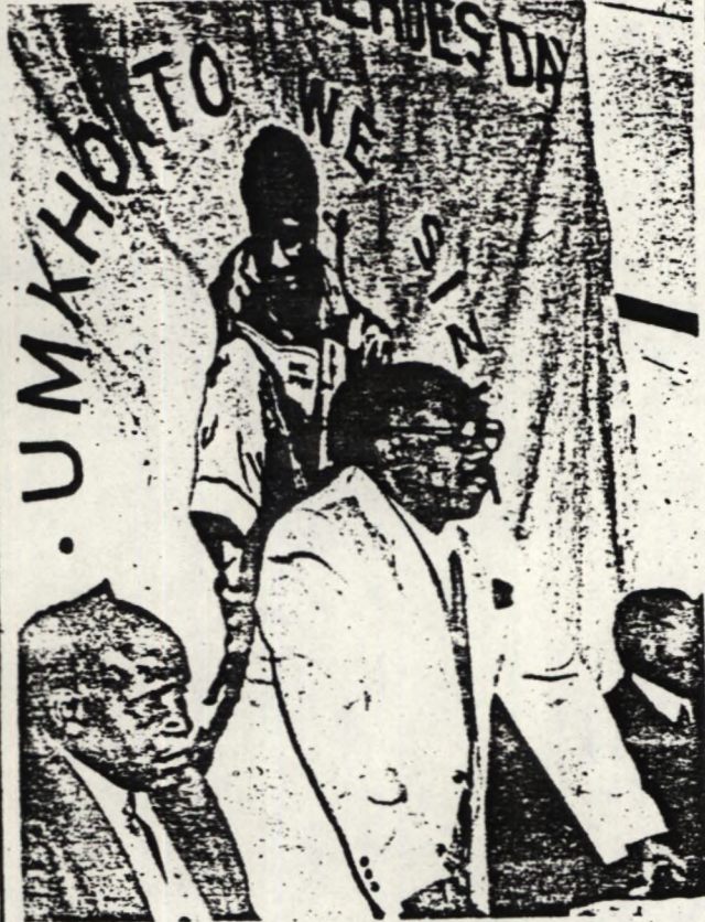
Cde A.Nzo, Secretary General of the ANC addressing a Heroes Day meeting. On his left is Cde T.Nkobi, Treasurer General.

THE African National Congress completely rejects the current propaganda linking it with plans to "start a black ethnic conflict in South Africa". The policy and programme of the ANC is known as enshrined in the Freedom Charter that we seek to establish a truly democratic South African society in which all the people of our country will participate as full equals in shaping their own destiny. This programme enjoys the support of the overwhelming majority of the people in South Africa and has been acclaimed both in South Africa and internationally as the only acceptable alternative to the policies of oppression of the majority and division along racial, tribal and ethnic lines, as pursued by the apartheid regime. Any suggestion that the ANC is departing from this course can only be described as falling within the plans of the enemy to discredit the ANC and eventually isolate it from the masses of the people.