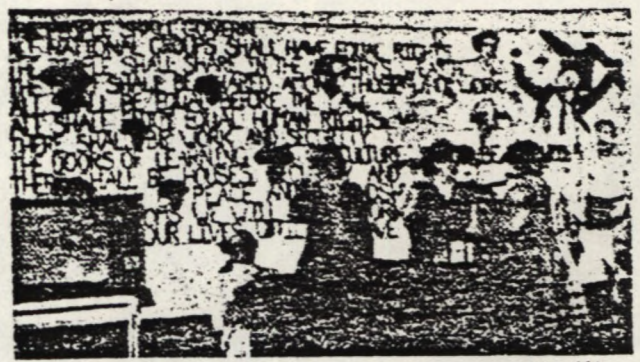
Rally around the Freedom Charter, our guide !!!

united democratic front they started at grassroot level. That is the correct starting point. At a time when it becomes apparent that the racist Botha and his lackeys are using every opportunity to sow division amongst us, it becomes even more urgent